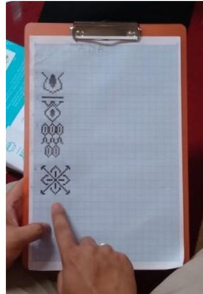
Figure 4. Markisa Babijo Ameh motif draft

This training is directed by design experts. In this training, the participants involved were also not members of the Weaving Group, but rather the community / young people who had talent in art. If the first training package is in the form of providing concepts implemented in the form of lectures and discussions, then this second training package of weaving craftsmen will be trained in practical ways to make designs that can compete. Therefore, in this training, weaving craftsmen will practice firsthand how to design a pattern from scratch on millimeter paper. All necessary equipment will be provided by the Team, so that the weavers can carry out the training comfortably