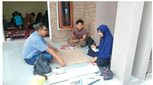
Figure 3. Training on making packaging boxes

Tenun community who were not members of the Weaving Group. The consideration taken is that, with a community capable of creating good packaging, the production chain will grow. So that in this activity, five new MSMEs have emerged engaged in the production of woven product packaging. The MSME has now become a good partner for the Weaving Group.