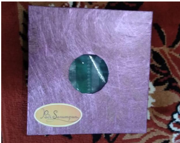
Figure 4. One example of a packaging box

an emotional bond between the Department of Industry and Trade and weaving which will ultimately benefit both parties