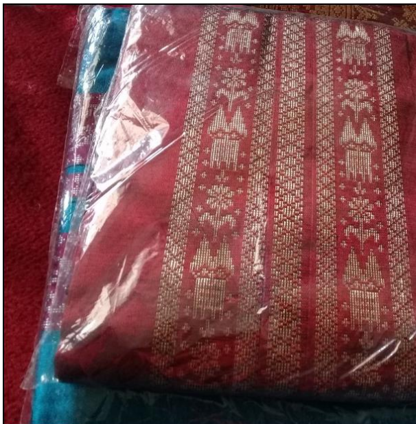
Figure 1. Weaving products with "Padi Nan Sarumpun" motif. The product is still packaged using plastic

Potentially, the Nagari Sungai Jambur Weaving Village has a huge opportunity to advance, and might be able to compete with Tenun Silungkang. First, because of the enthusiasm of the weaving craftsmen themselves. Then in terms of location, Kampung Tenun is located on the main road of Jalan Lintas Sumatera. The traffic on this road is very congested because it connects regencies and big cities in Sumatra. In fact, vehicles that were heading to Jakarta also crossed this road.