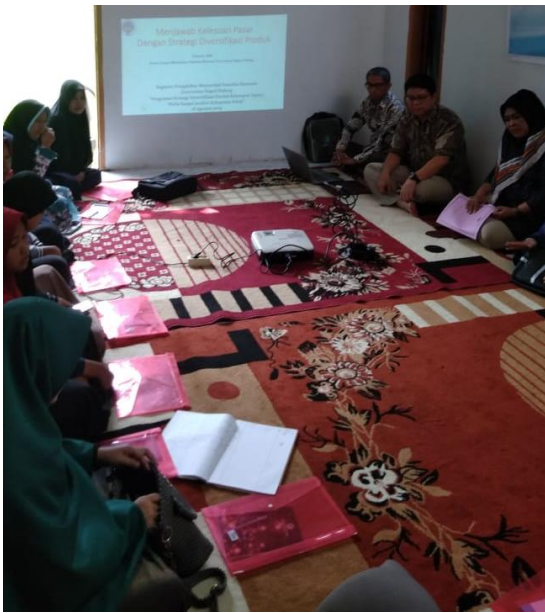
Figure 2. Training on Marketing Communication concepts to weaving group members

Nowadays, when competition in various industries is getting higher, aspects that are seen by prospective customers are no longer just product quality (Prentice, Wang, & Loureiro, 2019). But also other aspects such as the availability of various kinds of products. Product diversification is defined as an expansion of the selection of goods and services sold by companies by adding new products or services or improving the type, color, mode, size, type of existing products in order to obtain maximum profit (Shankar, Smith, & Rangaswamy, 2003)